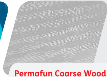
Permafun Coarse Wood