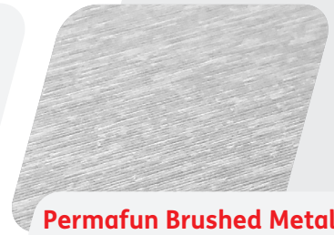
Permafun Brushed Metal